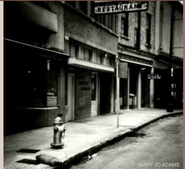
MARY JO ADAMS

Opening reception: Thursday, September 1, 5:30 - 7:30 pm Exhibit on display: September 1 - October 9, 2011 Viewing hours: Mon - Thu, 9 am - 9 pm | Fri, Sat, 9 am - 5 pm | Sun, 11 am - 5 pm Contact: Kathy Armstrong (210) 224-1848 | karmstrong@swschool.org Cathy Brillson (210) 224-1848 | cbrillson@swschool.org