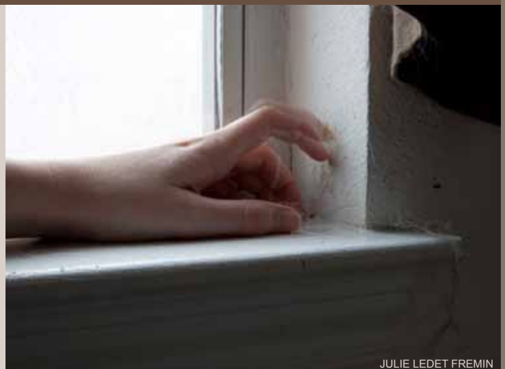
JULIE LEDET FREMIN

Opening reception: Thursday, September 1, 5:30 - 7:30 pm Exhibit on display: September 1 - November 20, 2011 Viewing hours: Mon - Sat, 9 am - 5 pm | Sun, 11 am - 4 pm Contact: Kathy Armstrong (210) 224-1848 | karmstrong@swschool.org Cathy Brillson (210) 224-1848 | cbrillson@swschool.org