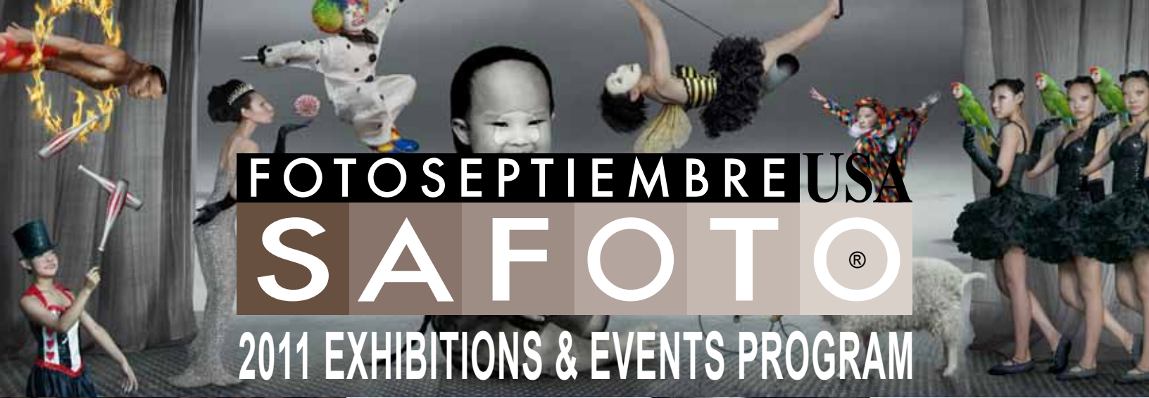
FOTO SEPTIEMBRE USA